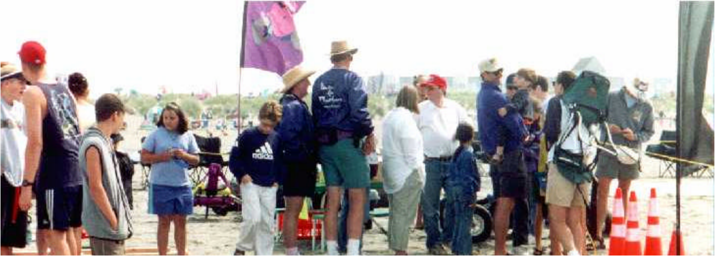
The WSIKF 2000 buggy ride line is a long one filled with both young and old!