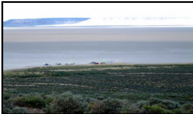
Behold the vast expanse that is Alvord!